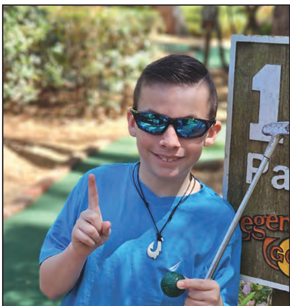
I wish to go on a train trip to Colorado through the Rocky Mountains Harrison. 9 • respiratory disorder

Thru rain, wind and waves we will endure. Why? Because we all want to make a difference. Our adventure started in 1995 and thru the years we have accumulated approximately 173 miles and 118.25 hours in the water. Similar to swimming from Kelleys Island to Buffalo, NY.