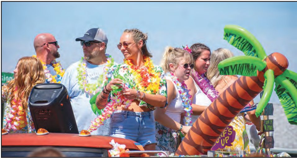
Parade Winner - Most Original (Float) - Captains Corner