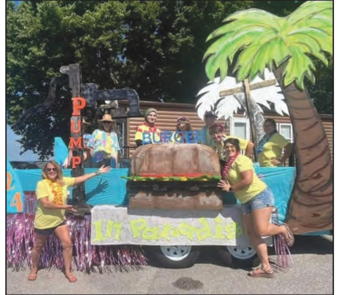
Parade Winner - Best Use of Theme (Float) The Village Pump