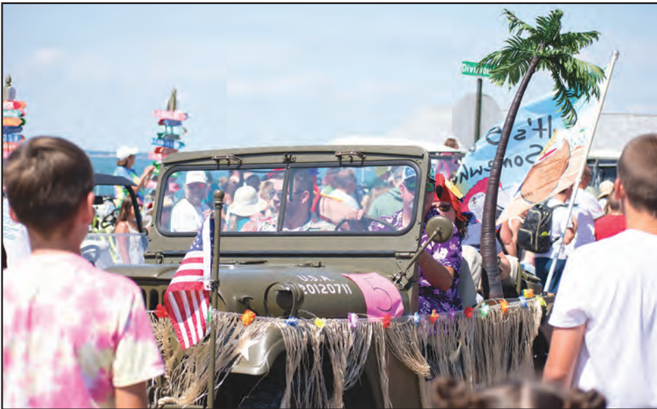
Parade Winner - Most Original (Golf Cart) - Army