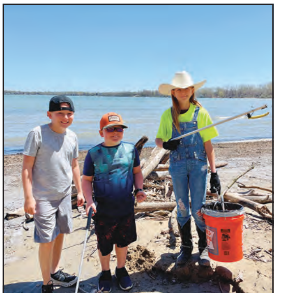
KI Clean up Kids

We offer sales and service on the following items: