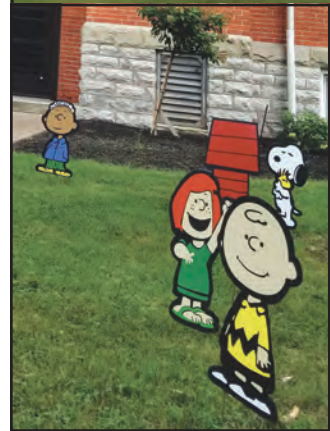
PHCR: Jan Jorski

The school year began on September 6 for the five Kelleys Island School students. The students are in grades 4, 6, and 7. Classrooms are now located in the original Estes school building with the library and gymnasium providing programming space. The teachers and staff have created welcoming space for the students in the spacious classrooms. Visit the school's website to learn more about the programs at the school https://www.kelleys.k12.oh.us/ .