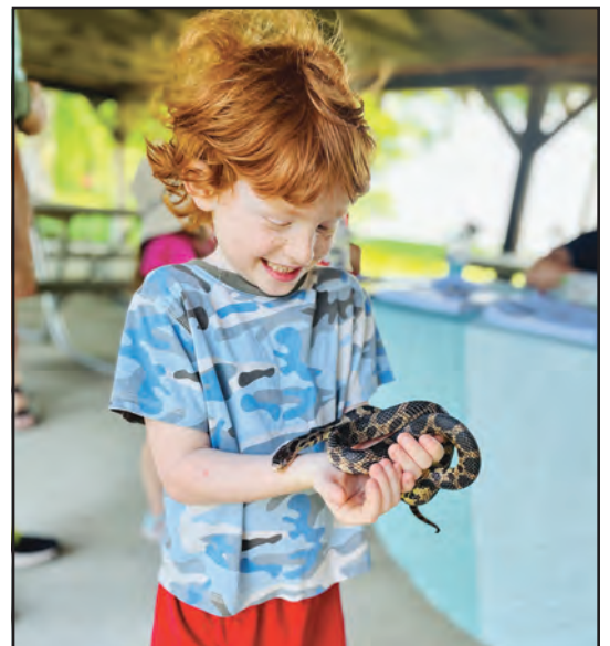
Science Saturday Snakes