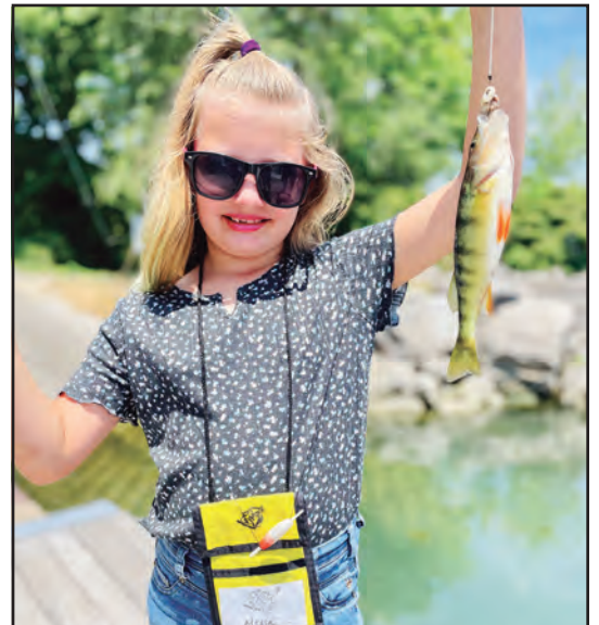
Nature Camp Fishing