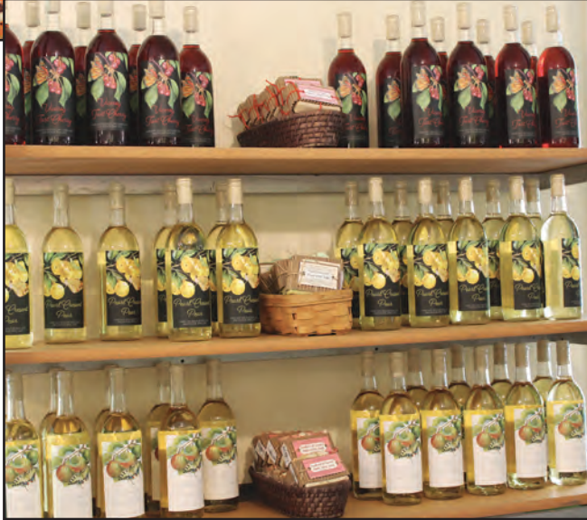
Right: Monarch Winery Wine Selections