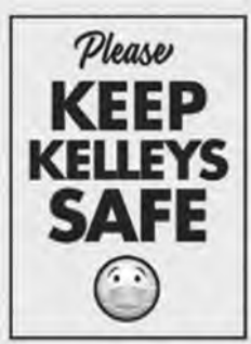
Keep Safe Sign

announcements. Cross your fingers and get vaccinated and continue to "Keep Kelleys Safe".