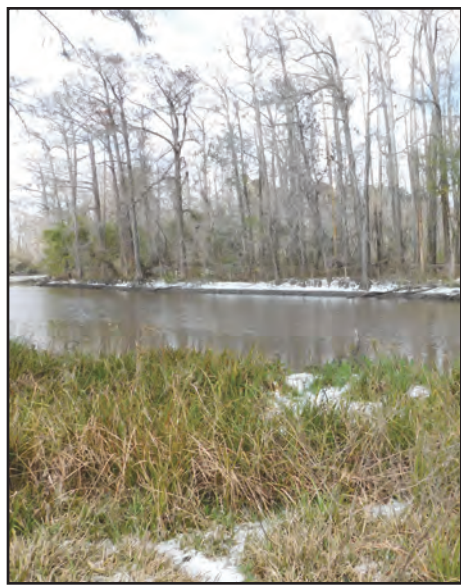
Adams Bayou with Snow

Southeast Texas along the Gulf and south in the Rio Grande Valley rarely has snow and below freezing temperatures. When cold fronts reach that far south, they rarely last more than a couple of days. We had a 14-day period of high temperatures in the 30s or 40s and two nights with single digit temperatures from February 10 to the 25th. The Gulf water temperature was 57 on February 8 which is below normal and dropped to 40, a near record low eight days later. High pressure systems created north winds cooling the region and Gulf water. The last time it was this cold for this long was 1931, 90 years ago. There were temperatures this low in 1978 and 1997, but only for a couple of days before returning to normal. Very few local people are old enough to remember weather this cold for this long.